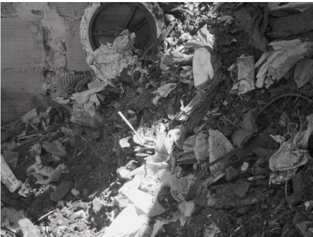
Figure 5. Trash buildup in the soil at the Rocinha Mais Verde space.

Tio Lino had gained access to a steep, vacant lot of land around 50 m 2 that had been used for years as a garbage dump. The land was adjacent to Tio's NGO— Rocinha Mundo da Arte —on a plot belonging to the Alegria das Crianças Creche . A two meter high pile of trash had built up on top of the site and another two meters had been compressed into the soil (Figure 5).