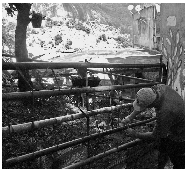
Figure 9. Resident creating a trellis on the fence at the Pedacinho da Terra garden in the Cachopa neighborhood of Rocinha.

Initially the neighbors were estranged from one another, but the interactions that occurred through the activity of gardening opened up a relationship that involved not only material production but the exchange of ideas and emotions, which evolved into a social practice and created an opening for shared cultural experience. This laid the groundwork for fostering a form of solidarity, in that it created a willingness for neighbors to take the risk of helping each other through taking on an informal form of public responsibility [84]. The importance of this is that it formed the basis for trust, cooperation, and new social ties. The garden requires little maintenance, and though it has suffered some physical setbacks (a paint spill from another neighbor's house and the theft of some edibles), it continues to receive regular upkeep from its neighbors. Due to the heavy foot traffic that moves through the area, the space continues to earn a positive response from the general public. Over time however, the general social stability of the neighborhood has deteriorated.