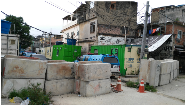
Figure 4. UPP unit headquarters in Manginhos, fortified with cement barricades.

Having heavily armed and violent drug gangs govern inner-city neighborhoods is clearly an untenable security situation, and no doubt some benefits have come from public security interventions under the UPP. However, the single most positive claim associated with life under UPP was that residents would be more able to walk around the favelas more freely without being subject to armed violence [1]. Yet, social gathering spaces, whether indoors (for example, cultural venues including children's theaters) or outdoors (for example, community gardens, parks or football fields) have become indiscriminate shooting galleries for police. People are not even safe from being shot while having lunch inside their homes. Military operations have shut down schools, kindergartens, health clinics, businesses, and access to favelas. Being involved in protests against the tens of thousands of forced evictions that have preceded the Games also presents a risk to personal safety. A large majority of residents now feel unable to move around their neighborhoods without fear of being shot by police [68].