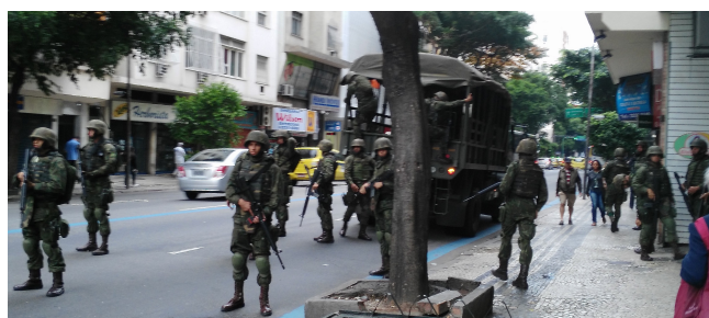
Figure 5. Troops stationed in Copacabana for the Olympics.

The federal government, under Interim president Michel Temer, claims there is "a solid security program" in place for the Olympics. Soldiers, helicopters and naval vessels have been federally deployed to bolster security operations for the event (Figure 5), but state authorities continue to delay civil police salaries and scale back pacification ambitions. As the crisis deepens, publically aired discontent between city and state leaders about how public security is being mismanaged continues to grow [103]. In a city of 12 million people where armed muggings, stray bullets, fatal car-jackings, and favela wars are escalating, and public servants no longer being paid, there is public anger at the R$ 2.9 billion emergency funds that have been redirected away from critical needs to service the Olympics, especially at a time when the Chief of Civil Police, Fernando Veloso, admits he "can't discard the possibility of a [security] collapse" because police are "at the limit of [their] operational capacity" [74].