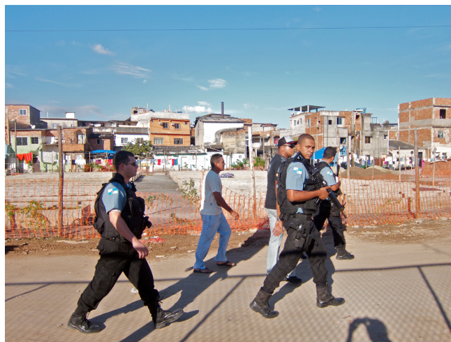
Figure 2. UPP patrol, Manginhos favela, 2013.

Military pacification occurs through a massive coordinated military invasion of the favela—by BOPE, Choque, CORE, and a range of armed forces and other police divisions. This is followed by a BOPE occupation of the favela, which after a time transitions from control to UPP units, with Special Ops troops continuing to patrol and assist in operations when required (Figure 2).