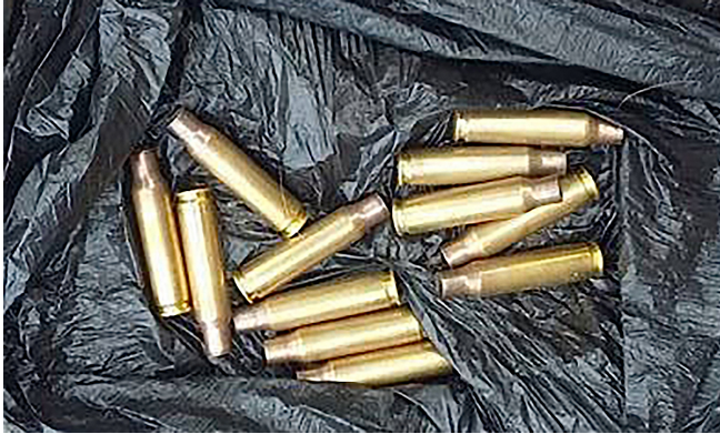
Figure 3. Spent shell casings collected from the ground after a police shooting in the Manginhos favela, 2015.